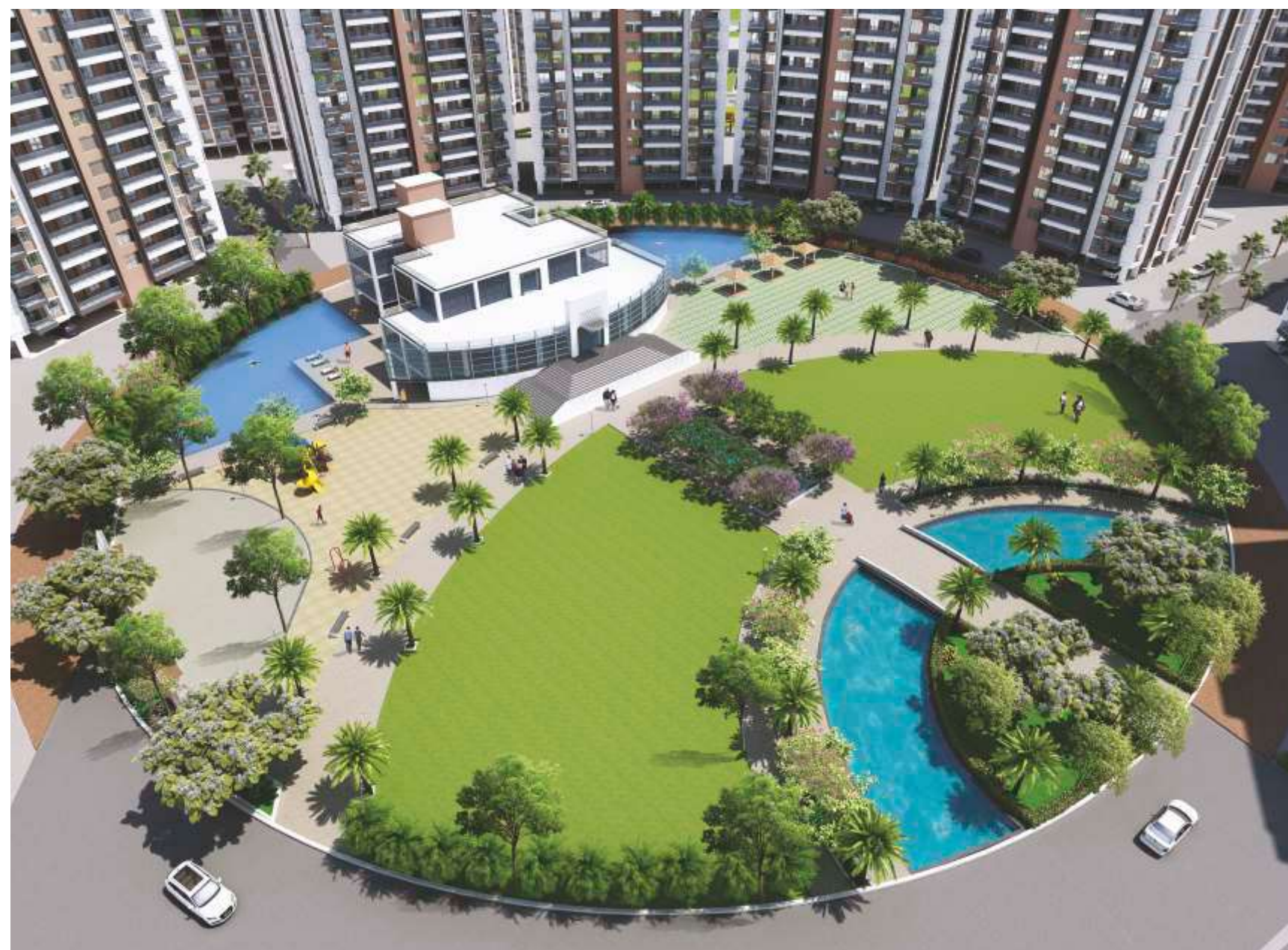
BEAUTIFULLY DESIGNED CLUB HOUSE WITH GARDEN AT SHIV KAILASA